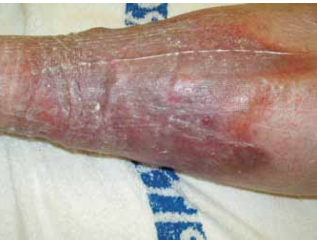
Figure 3. Ulcer healed after 10 weeks.